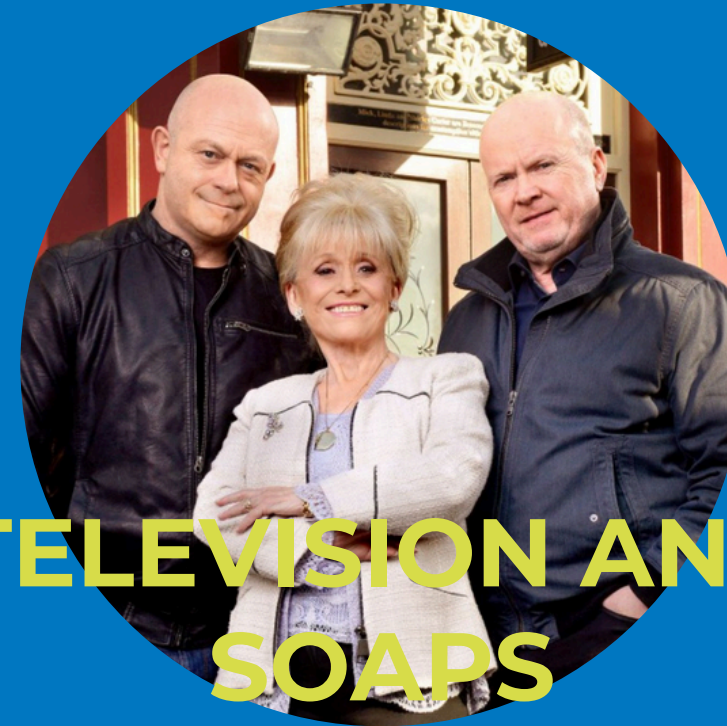
TELEVISION AND SOAPS