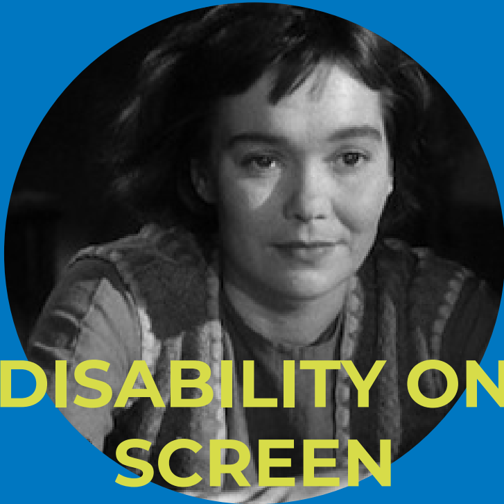
DISABILITY ON SCREEN