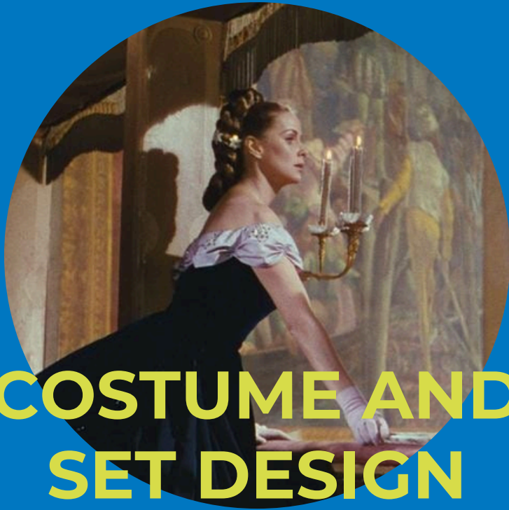
COSTUME AND SET DESIGN