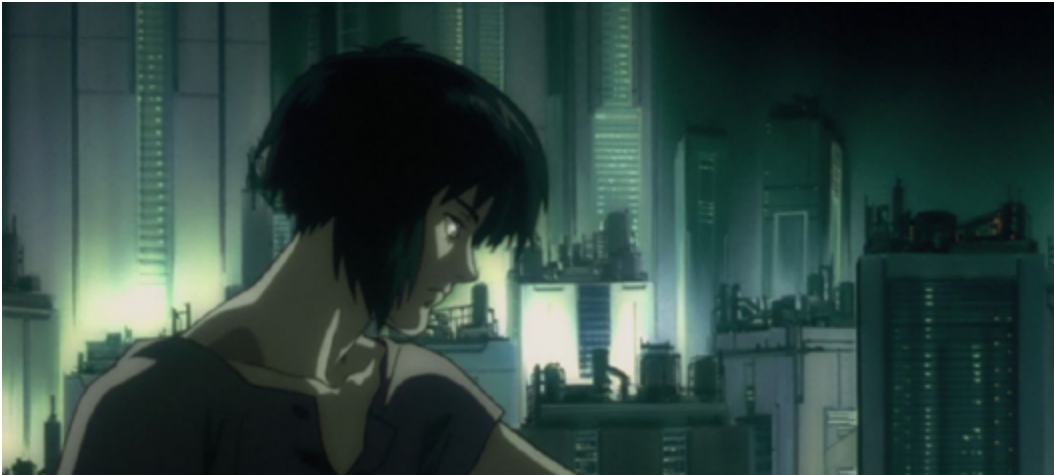
Ghost in the shell, Mamoru Oshii, 1995

After the boom of the 80s, the anime industry started to decline in early 90s. Hideaki Anno wrote and directed the controversial anime Neon Genesis Evangelion (1995) to try to revive the anime industry. The cyberpunk anime Ghost in the Shell , directed by Mamoru Oshii in 1995, became cult and helped increase the awareness of anime in international markets.