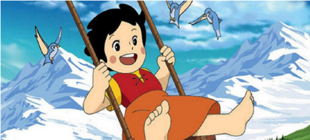
Heidi created by Isao Takahata, 1974

The Mangas (comic books) grew in popularity, many of which were animated later. But Japanese animation market shrank due to competition from television. Older studios struggled or went bankrupt and young animators founded new studios where they were allowed to experiment (such as Madhouse).