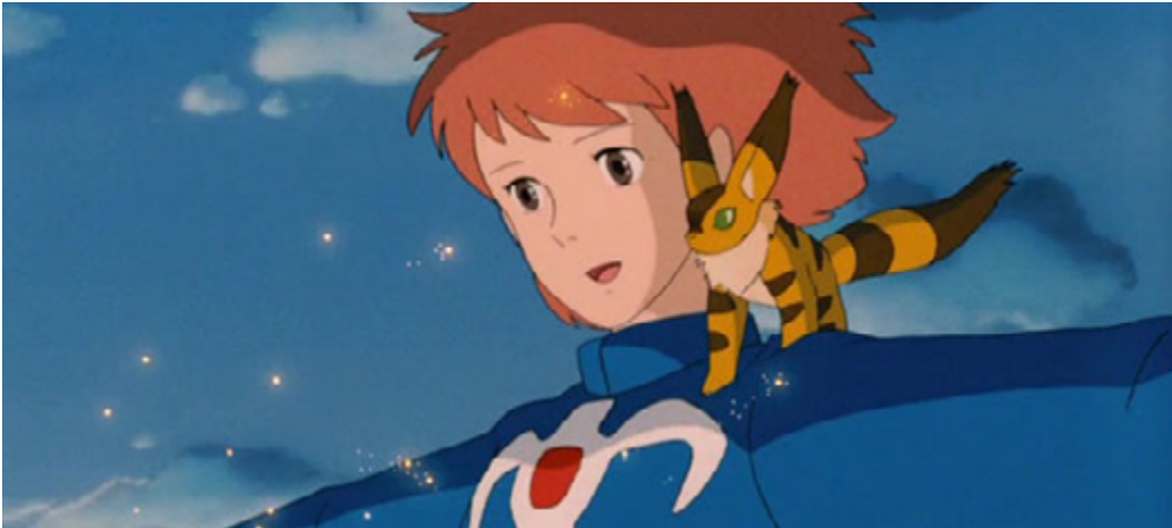
Nausicaä of the Valley of the Wind, Hayao Miyazaki, 1984