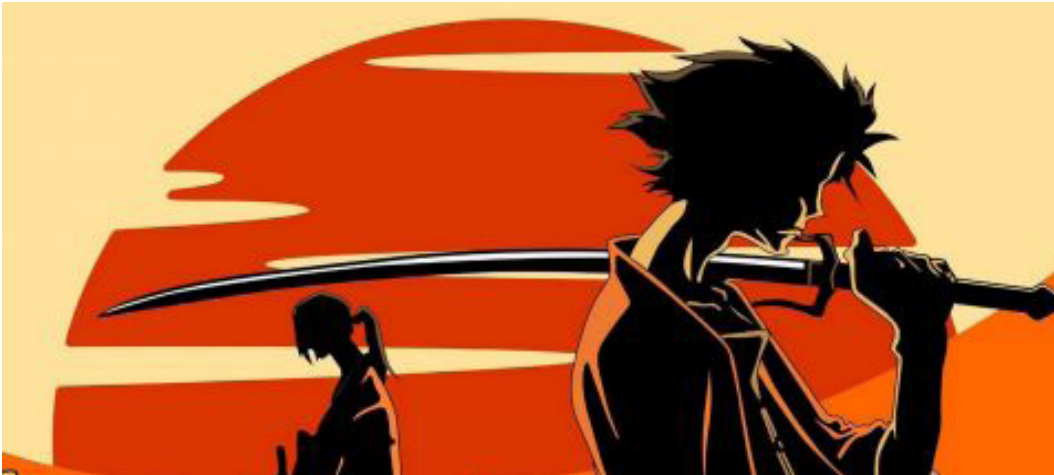
Samurai Champloo, Shinichirō Watanabe, 2005

Early 2000s, the boom of anime series from the 90s is still on. Japanese animation is internationally recognised and praised. This success allows the emergence of many genres: the real robot and super robot genres are revived from the 70s, new genres such as romance, harem and slice of life appear, manga's adaptations are building strong fanbases (such as Fullmetal Alchemist , Naruto or Death Note ) and more experimental trends are flourishing ( Samurai Champloo , 2005).