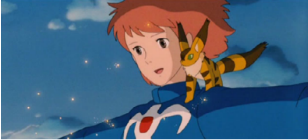
Nausicaä of the Valley of the Wind, Hayao Miyazaki, 1984