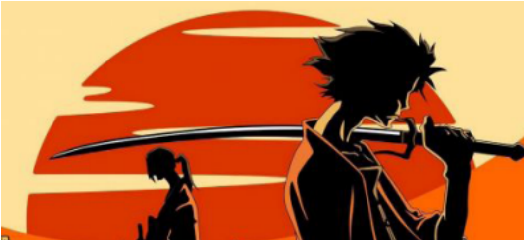
Samurai Champloo, Shinichirō Watanabe, 2005

Early 2000s, the boom of anime series from the 90s is still on. Japanese animation is internationally recognised and praised. This success allows the emergence of many genres: the real robot and super robot genres are revived from the 70s, new genres such as romance, harem and slice of life appear, manga's adaptations are building strong fanbases (such as Fullmetal Alchemist , Naruto or Death Note ) and more experimental trends are flourishing ( Samurai Champloo , 2005).