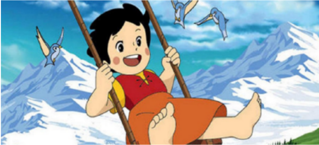
Heidi created by Isao Takahata, 1974

The Mangas (comic books) grew in popularity, many of which were animated later. But Japanese animation market shrank due to competition from television. Older studios struggled or went bankrupt and young animators founded new studios where they were allowed to experiment (such as Madhouse).