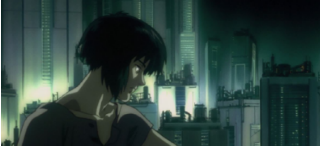
Ghost in the shell, Mamoru Oshii, 1995

After the boom of the 80s, the anime industry started to decline in early 90s. Hideaki Anno wrote and directed the controversial anime Neon Genesis Evangelion (1995) to try to revive the anime industry. The cyberpunk anime Ghost in the Shell , directed by Mamoru Oshii in 1995, became cult and helped increase the awareness of anime in international markets.